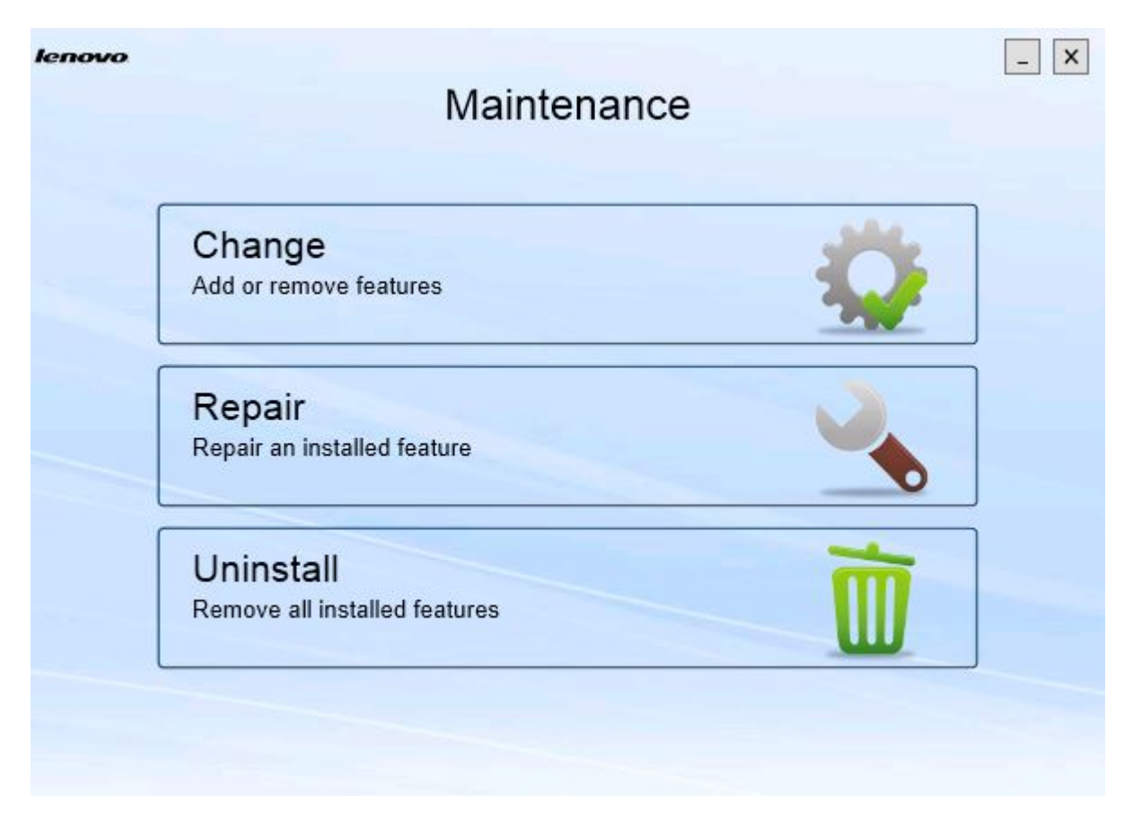
Figure 10. Maintenance page

If components were previously installed byLenovo XClarity Integrator Installer, the Maintenance page opens when you start the Lenovo XClarity Integrator Installer.