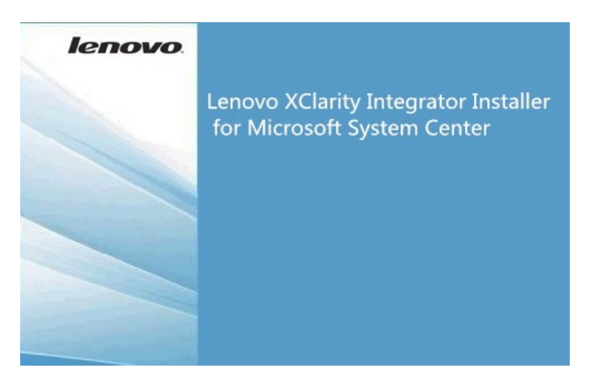
Figure 1. Initializing the setup wizard

The splash page for Lenovo XClarity Integrator Installer for Microsoft System Center opens, followed by a language selection list.